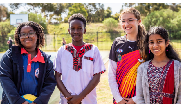
(from Top) Annual Music Showcase; Year 11 student shows Primary students her Imago Dei prize winning portrait, and the student-led Belonging Day.

highlights include being one of five independent schools across Victoria to be recognised by The Age in its 2024 Schools that Excel Awards. Most pleasing about this award is that it tracks growth over the last decade and shines a light on the hard work and dedication of our entire College community over a sustained period. This recognition was deeply humbling, serving as a reminder of our ongoing commitment to educational excellence grounded in Christian values.