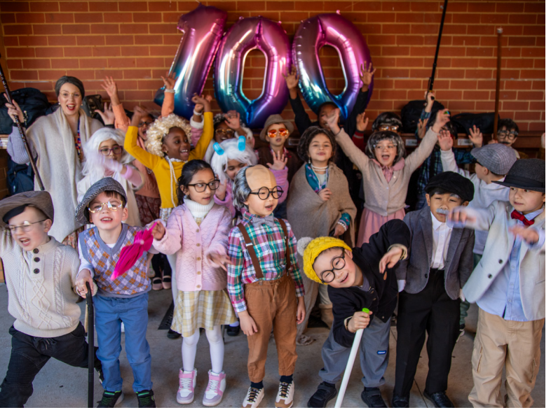
100 Days of School