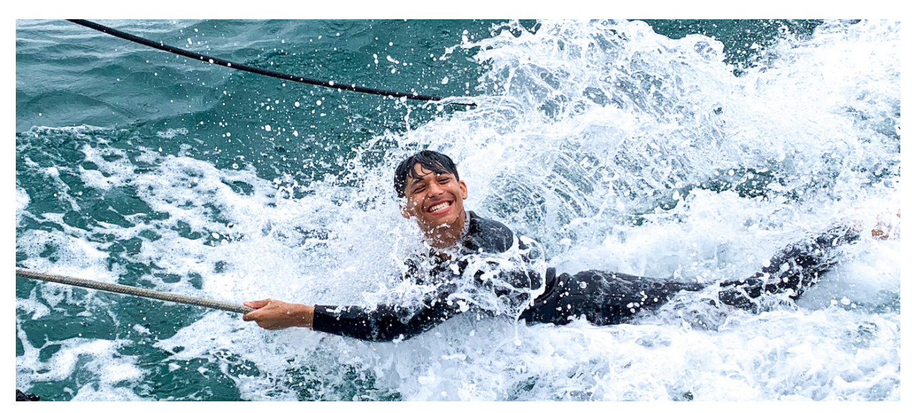
Snorkelling with Seals